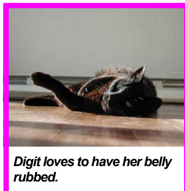
Digit loves to have her belly rubbed.