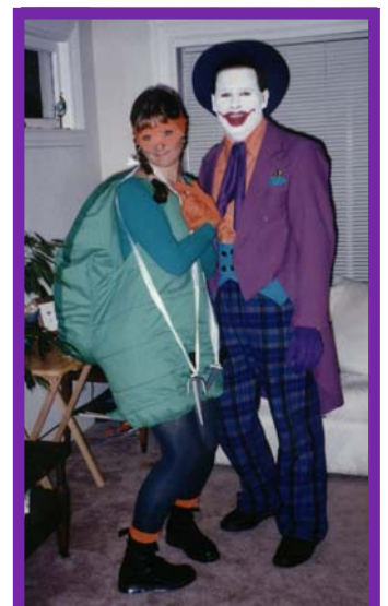
Halloween — A Teenage Mutant Ninja Turtle and The Joker.

Please call us anytime at 1-707-644-7764 or e-mail us at jamielee6@earthlink.net , or you can call our adoption counselors at The Independent Adoption Center at 1-800-877-OPEN (6736). We look forward to hearing from you!